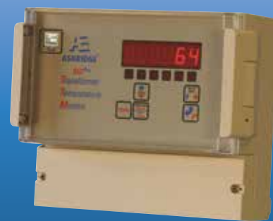
Wall Mounted Version