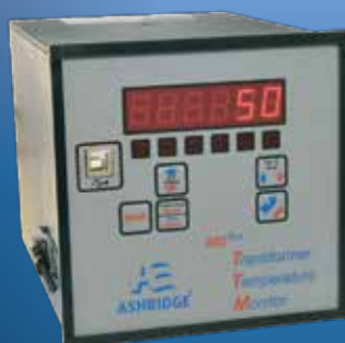
144 x 144 DIN Panel Mounted Version