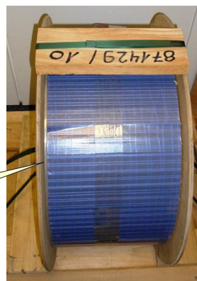
Drum with cable protection cover fixed on pallet

Product specifications and descriptions in this document are subject to change without notice and are not binding to AP Sensing.