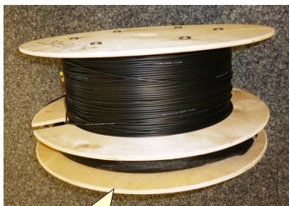
Pocket for the factory attached inner optical connector