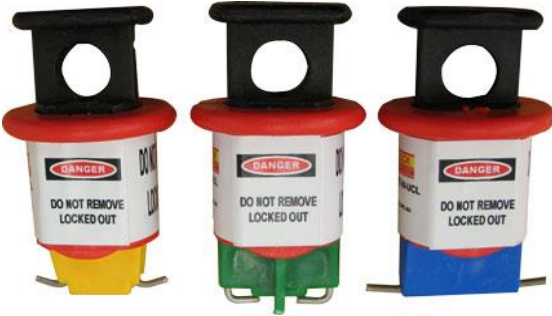
LM-PO-CBL LM-PI-CBL LM-POW-CBL