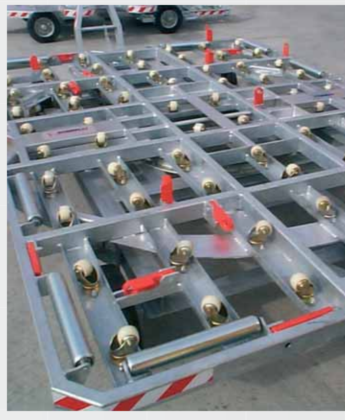
• Dolly with standard Colson cargo castors

End results: a Colson castor with a load capacity of 250 kg, with a high resistance to shock loads and a long service life. The precision ball bearings in both wheel and swivelhead secure a low rolling- and swivelling effort, enabling easy manoeuvring of the freight on loaderdecks. Newly developed seals for wheel and fork guarantee maintenance freecastors. To prevent corrosion, the electrolitically zinc plated castor is given an additional yellow passivated coating.