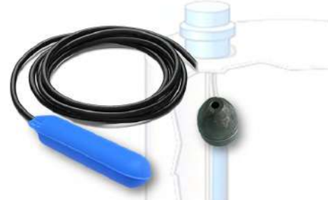
TUBA 1" 1/4