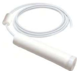
TUBA 125 C

Range of level detectors intended to work in extremely aggressive liquids such as sulphuric acid, and or very hot liquids reaching temperatures up to 150° C.