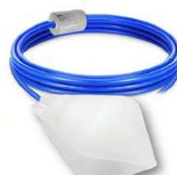
ATS 165 EP