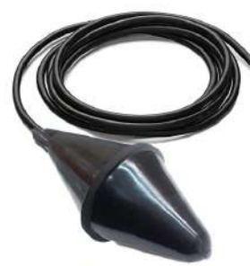
AT 120 HR HY