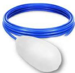
AQUA MEDIUM EP