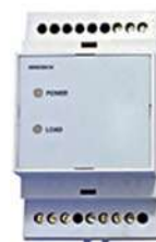
AT 10 - AT 20