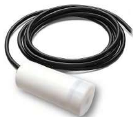
TUBA 150 C