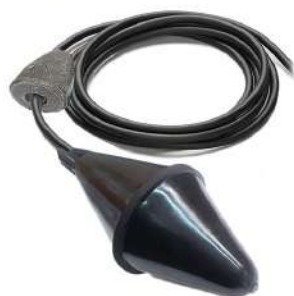
SOBA HR HY